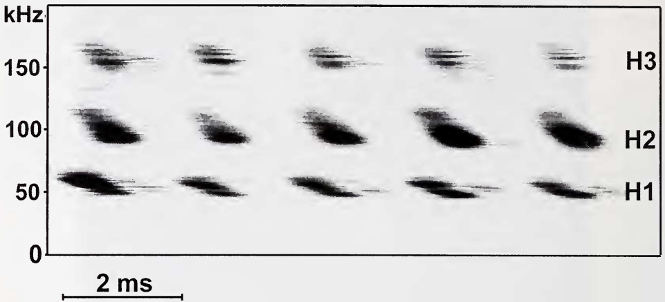
Fig. 2. Sonagram of echolocation calls from Thyroptera discifera . The short FM sweeps consist of the fundamental frequency (H1) and two harmonics (H2, H3). (Sequence was edited: call intervals have been shortened.)